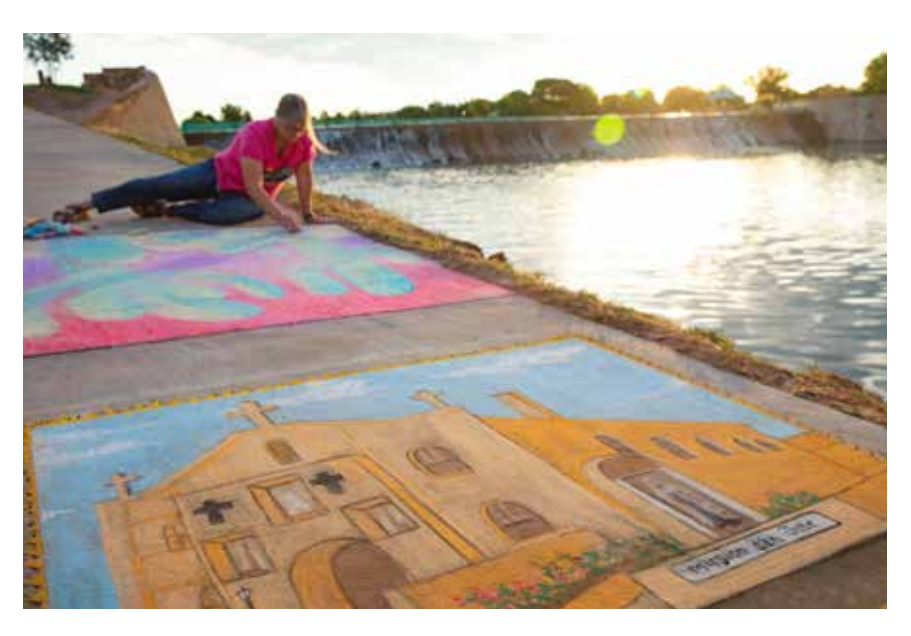
Chalk drawing near the Pecos River Recreation Area