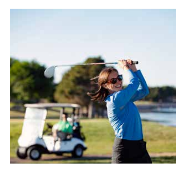
Lake Carlsbad Municipal Golf Course