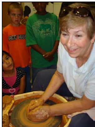
The Carlsbad Art Assn once again gave demonstrations for area school children. This popular program is in conjunction with the bi-annual art exhibit of association members' work.

The Carlsbad Museum & Art Center Open House, "Night Before . . . At the Museum," held on Saturday, December 12, 2009, was a huge success with a record number of people attending. Visitors not only enjoyed the wonderful museum exhibits, but were treated to entertainment, refreshments, a visit with Santa and a personal photograph all free of charge, a gift to the community from the CMAC and the City of Carlsbad. Proceeds from the gift shop annual sale event were wonderful, a winner for continuing operations support of the Museum.